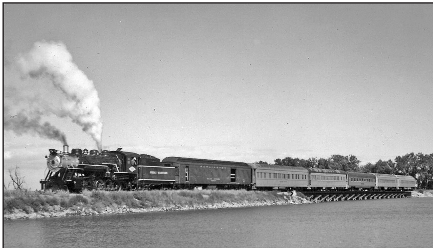
GW #90 was photographed on the Roulard trestle between Eaton and Severance on its last Club trip on September 9, 1962.