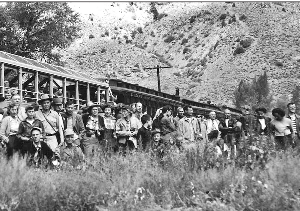
Now, sixty-five years later can you identify others?