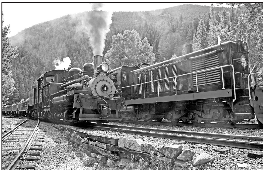
The Georgetown Loop Railroad West Side Lumber Company Shay Number 9 passes the Club charter train led by Georgetown Loop Locomotive 1203.