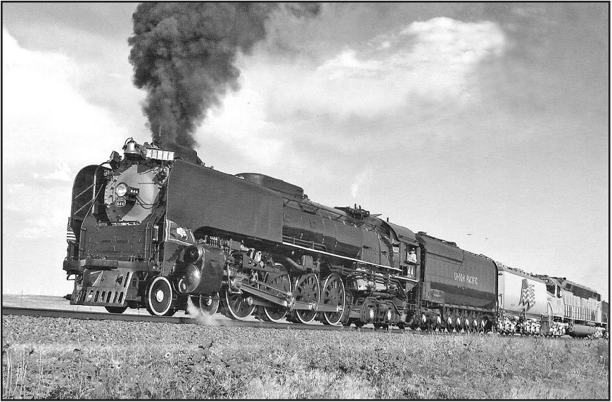
The 844 crew did two long reverse moves for the railfans on the Cheyenne Depot Museum's 2013 Steam Train Excursion.