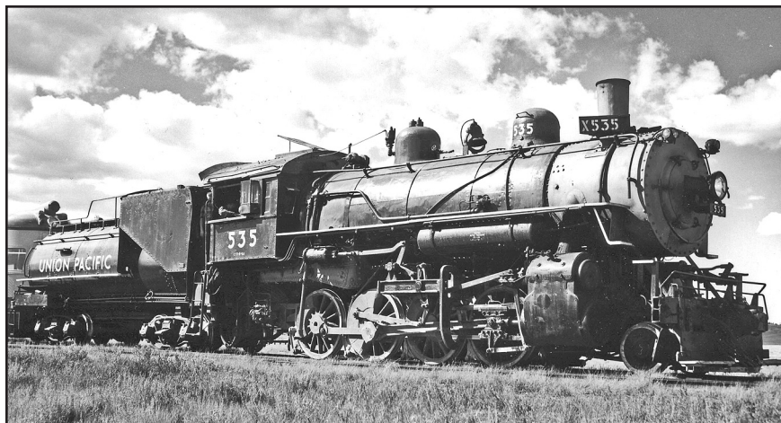
UP #535 is at North Gate, Colorado, on the UP Coalmont branch. Note the end of the observation car at the far left. This September 15, 1957, Club trip was unique in that it included six stock cars, with odors, departing Laramie, Wyoming.